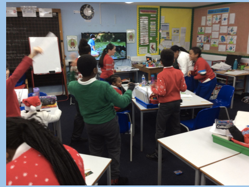
Some photos of our class Christmas parties!

5D children had PANTS lesson to understand that they have a right to say no and if they need to speak out about something, someone will listen.