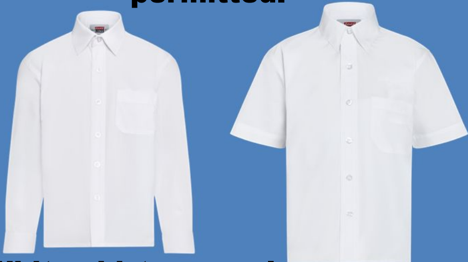
White shirts- no polos