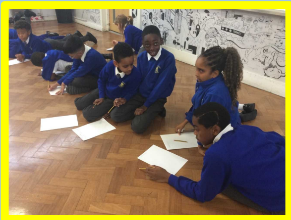
Some of our Year 5s and 6s taking part in a poetry workshop this week.