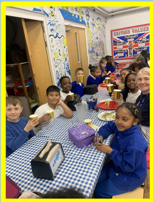
Year 3's golden lunch!