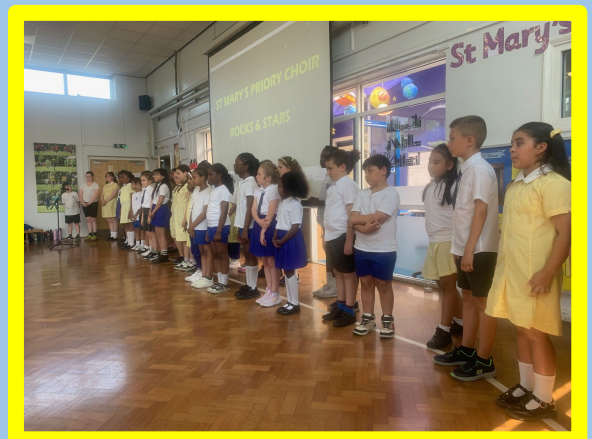
Our wonderful choir performing