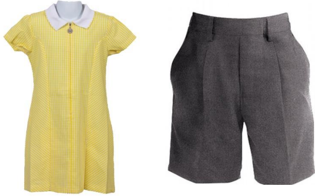
Summer uniform- yellow dress and shorts are permitted.

Jumpers/cardigans should be knit and not sweatshirt material (sweatshirts are for our PE uniform only).