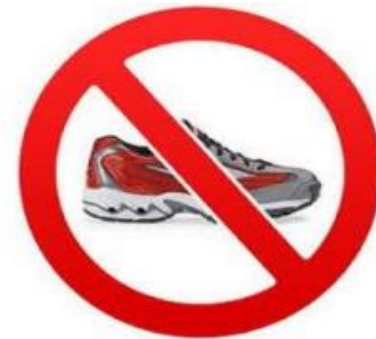
Plain black shoes - no high-top boots or trainers