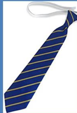
School tie (optional in the infants)