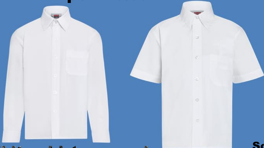
White shirts- no polos