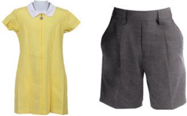
Summer uniform- yellow dress and shorts are permitted.

Jumpers/cardigans should be knit and not sweatshirt material (sweatshirts are for our PE uniform only).