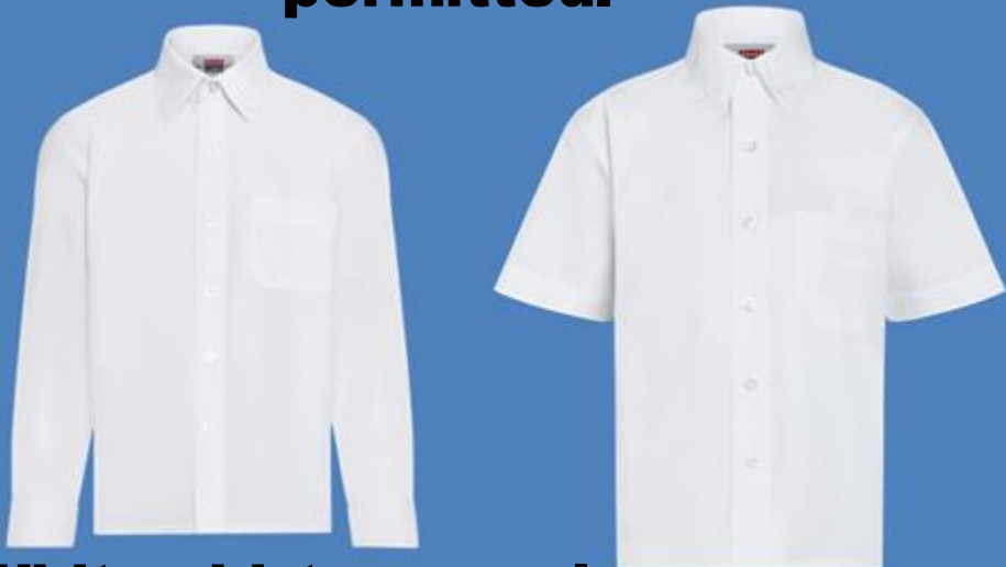
White shirts- no polos