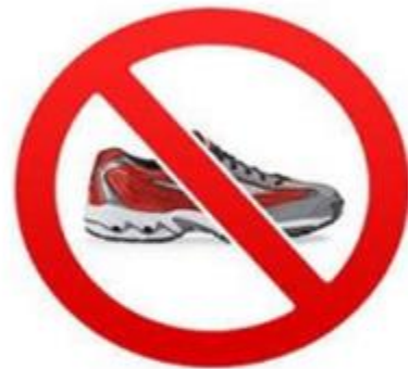
Plain black shoes - no high-top boots or trainers