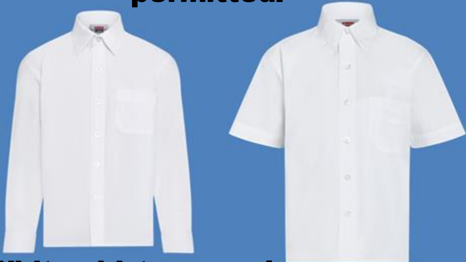
White shirts- no polos