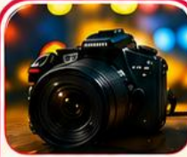
PHOTO SHOOT VOUCHER FOR 2 PEOPLE